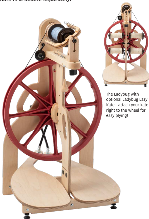
The Ladybug with optional Ladybug Lazy Kate—attach your kate right to the wheel for easy plying!

Friendly to entry-level and seasoned spinners alike, our Ladybug spinning wheel is easy to treadle, easy to take with you...and as cute as a bug! With solid Schacht construction and an eye-catching design, the Ladybug is both functional and charming. Made of maple plywood and solid maple, the Ladybug sports integrated carrying handles. Its attached lazy kate is available separately.