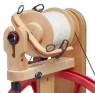
The Ladybug with Bulky Plyer Flyer (also available for Sidekick, Flatiron, and Matchless spinning wheels).