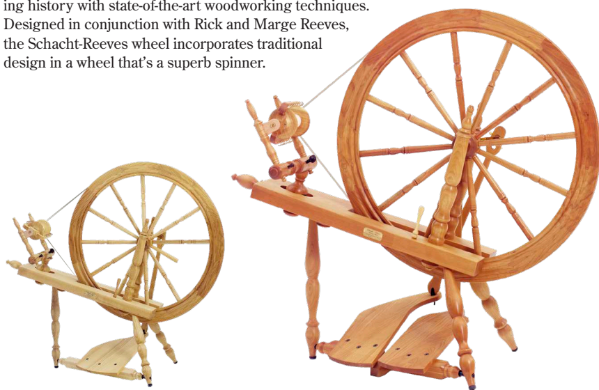
The Schacht-Reeves spinning wheel gives you a wide range of ratios to make your spinning smooth and easy. Left: 30" single treadle. Right: 30" cherry double treadle.