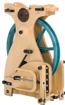
The Sidekick folding travel wheel folds up easily so it can go where you want to go.